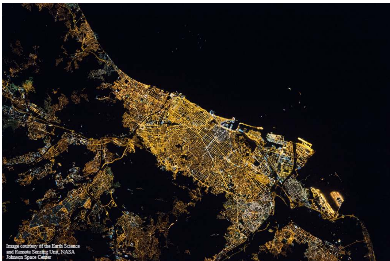
Figure 2. International Space Station night image of Barcelona 18 April 2013, time: 22:10:46 GMT (local time 00:10:46) (ISS035-E-23385; NASA Johnson Space Center; https://eol.jsc.nasa.gov ).

designed to scale the spectral interaction between a given light spectrum and the published measurements of the melatonin suppression action spectrum (MSAS) (Brainard et al. 2001; Thapan et al. 2001). The MSI has been designed to separate the effect of the shape of a spectrum from its averaged luminous intensity by making use of the MSAS. The MSI determinations were done for the house location of each participant involved in the study and derived as a number generally ranging from 0 to 1. The MSI represents to what extent the spectrum shape of different lights are efficient to suppress the melatonin production compared with the spectrum shape of the International Commission on Illumination (CIE) illuminant D65 that has been arbitrarily set to the highest value (one). The CIE Standard Illuminant D65 corresponds approximately to the average midday sunlight in Western and Northern Europe.