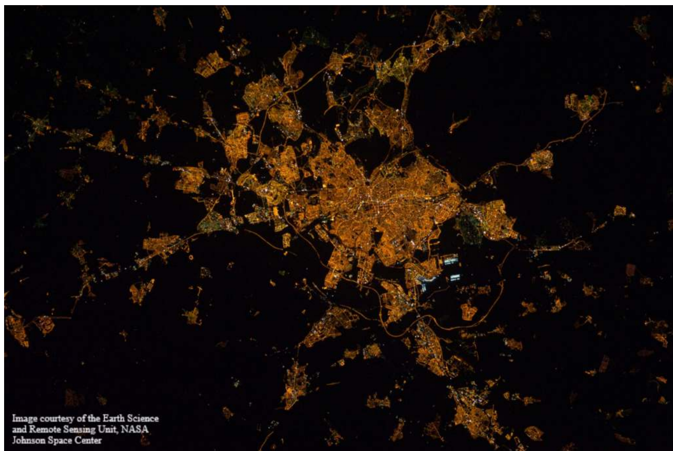
Figure 1. International Space Station night image of Madrid 12 February 2012, time: 02:22:46 GMT (local time 03:22:46) (ISS030-E-82052; NASA Johnson Space Center; https://eol.jsc.nasa.gov ).

We also calculated an index of outdoor blue light spectrum using an approach described in Aubé et al. (2013) to calculate the melatonin suppression index (MSI) at each pixel of the image. The MSI is related to exposure to blue light and is a metric