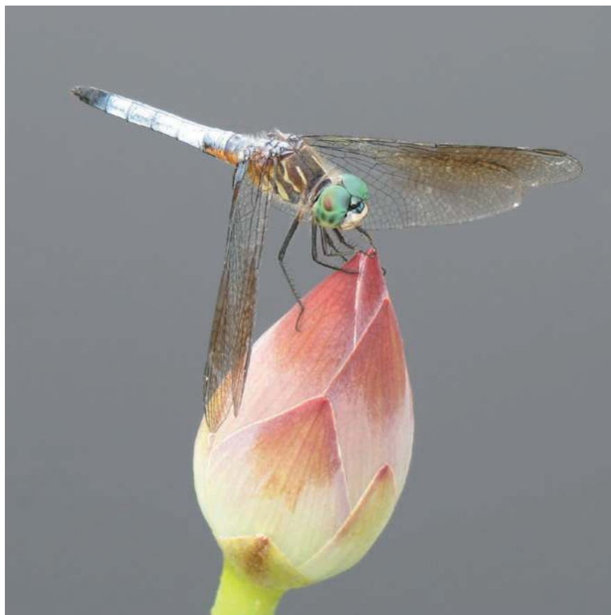
Dragonfly on Lotus